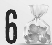
6 Skip the plastic produce bags