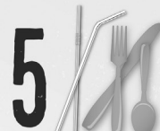
5 Say no to disposable straws & cutlery