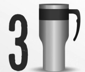
3 Bring your own cup