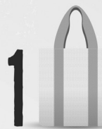
1 Bring your own shopping bag