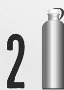
2 Carry a reusable water bottle